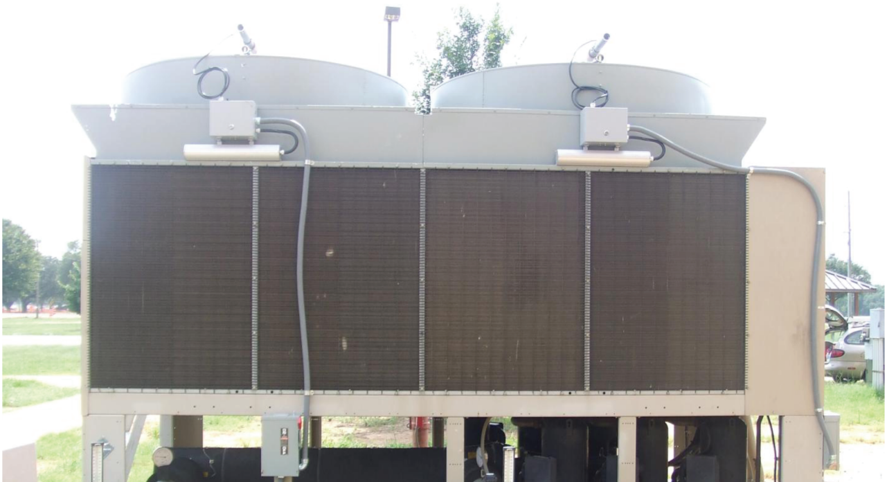
Twin Turbine and Manifold System on an 8-fan HVAC Unit