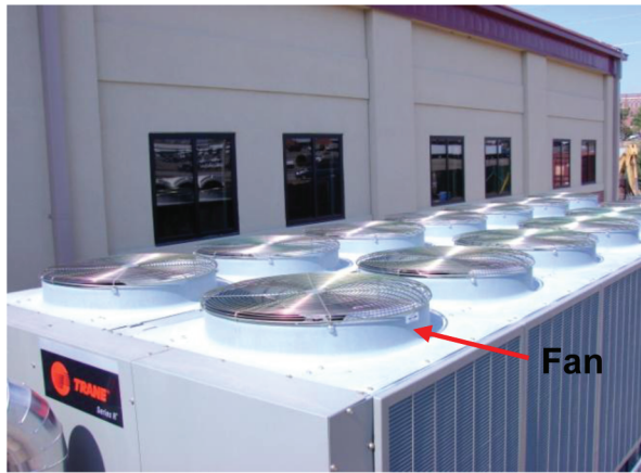
14-Fan HVAC Unit