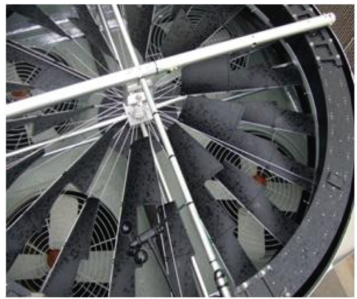
Turbine and Manifold on a 4-fan HVAC Unit